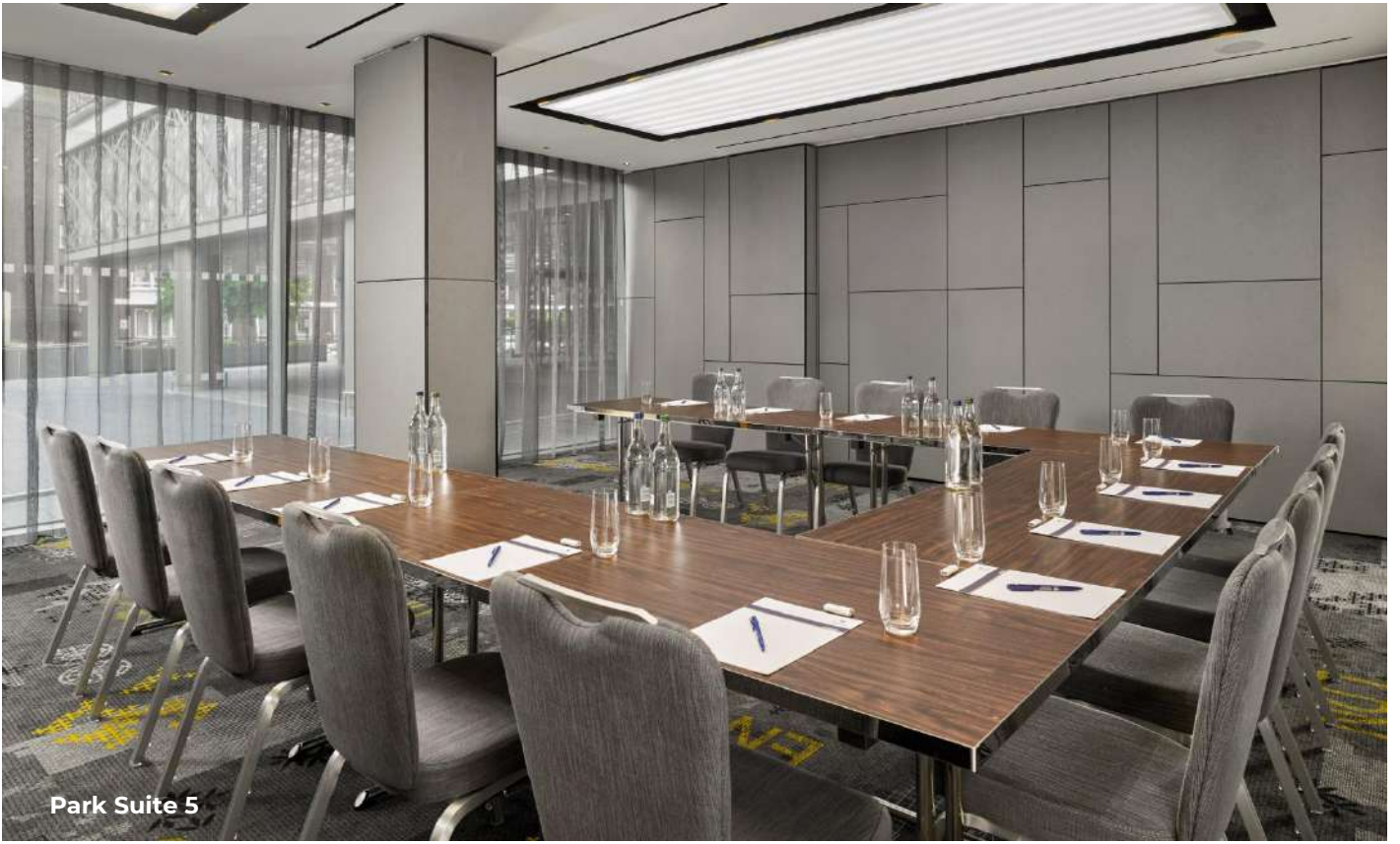
Park Suite 5